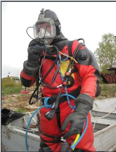
Checking "coms" before commencing the dive

The safest place for a diver is on the surface. Utilizing scanning sonar before the diver descends can identify potential hazards and provide critical information for effective dive planning. The most efficient use of scanning sonar for directing divers is when surface supplied air and hardwire communications are used.