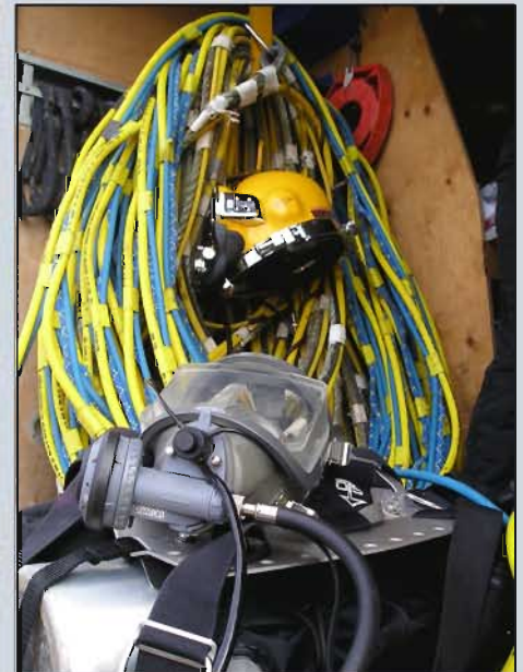
Surface supplied helmet and band mask with hardwire communications

In the lower left sonar image, anchor cables attached to floating dock slips at a marina were hazards identified during a body search. The dive was planned (and monitored in real time on the scanning sonar display) so there was never a risk of the tethered diver being entrapped by swimming under the anchor lines.