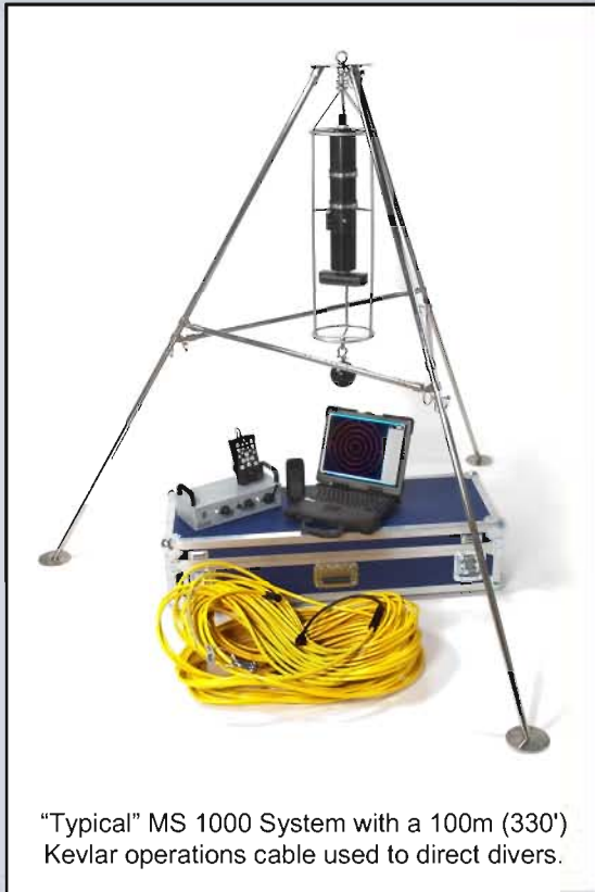
"Typical" MS 1000 System with a 100m (330') Kevlar operations cable used to direct divers.