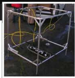
MS 1000 PC-Based Scanning Sonar and High Resolution Sonar Head (left), and deployment frame (above)

The purpose of this survey was to determine the condition of the vertical face of the pier and identify scour or undercutting of the structure.