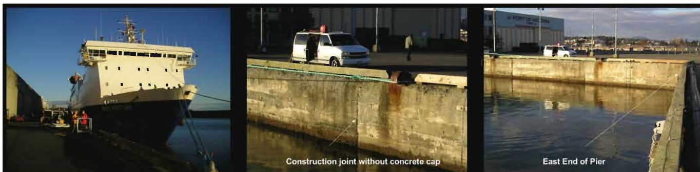
Construction joint without concrete cap